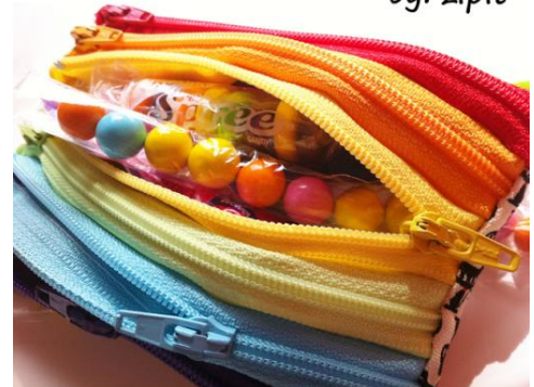
Easy Peasy Zipper Pouch Tutorial by: zipit